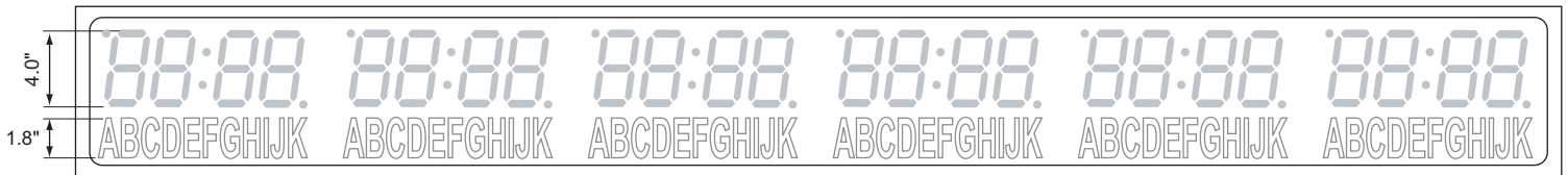
EXAMPLE WITH VINYL STICK-ON TEXT