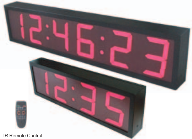
IR Remote Control