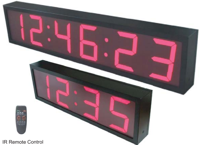
IR Remote Control