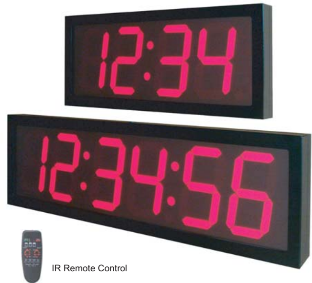
IR Remote Control